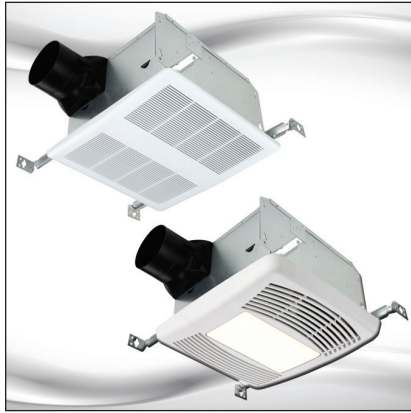
TF & TF-L Tranquil Bathroom Fans

Continental Fan's TF Tranquil Bathroom Fans are available in non-lighted and lighted versions, suitable for all interiors. The built-in damper prevents a backdraft, keeping tempered air in a home when the fan is not operating.