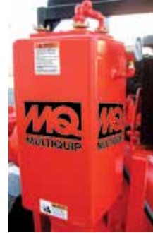
Simple, rugged air separator chamber