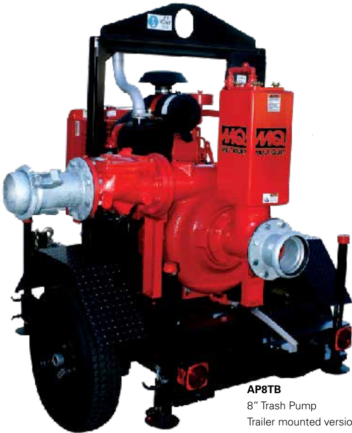
AP8TB 8" Trash Pump Trailer mounted version shown Maximum Flow - 2,700 GPM Maximum Head - 213 feet Maximum Solids - 4-inch