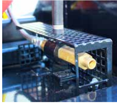
Venturi assembly is backed with lifetime warranty