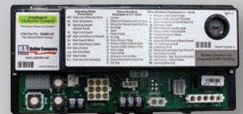
Intelligent Hydronic Control

There's a few reasons why over TWO MILLION Burnham Series 2 boilers have been installed in American homes. Performance, reliability, safety, and overall efficiency have a lot to do with it. The Series 2 is designed to work with an existing chimney, and is available in many sizes to fit the needs of virtually any application. With the Intelligent Hydronic Control, a new full feature control system, and improved operating efficiencies, U.S. Boiler Company is providing even more good reasons why the Series 2 will remain at the top of the list for years to come.