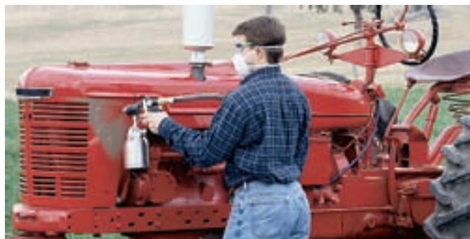
Great for restoration projects