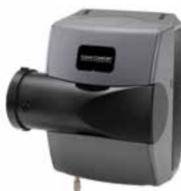
12 and 17 Gallon