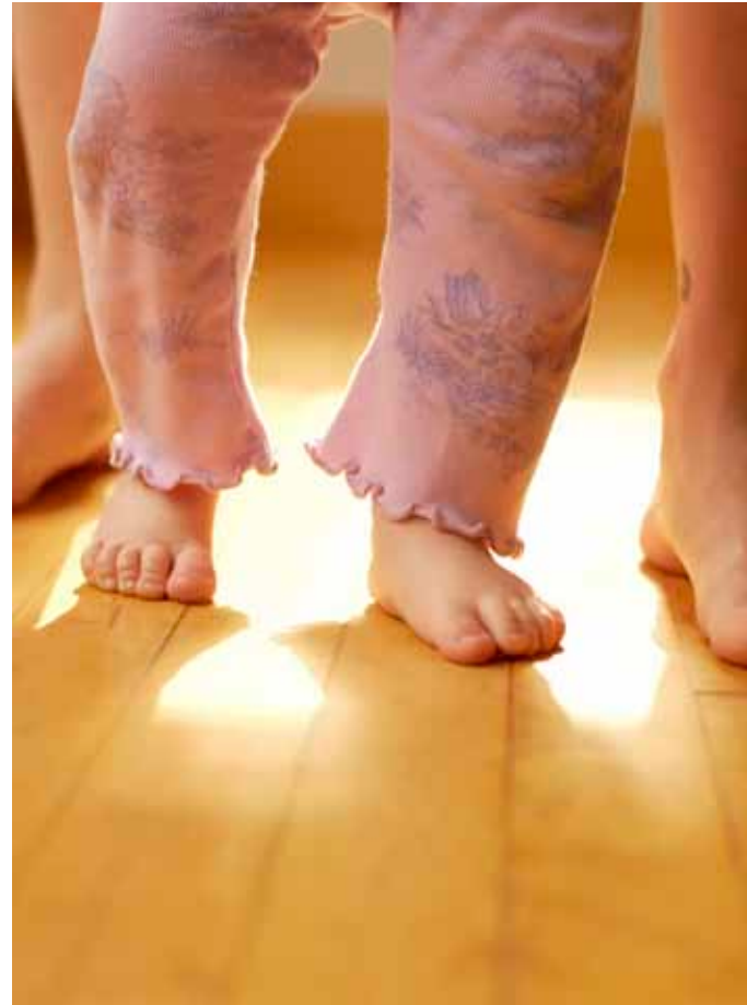
Triangle Tube's Prestige boilers work efficiently with all radiant heating systems, including the latest radiant flooring systems.