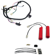
Heated hand grips kit 753-08698