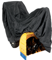
Universal blower cover 490-290-0010