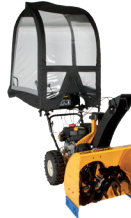
Deluxe universal snow blower cab 490-241-0032