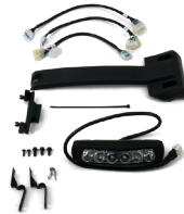
LED light bar kit 753-08629