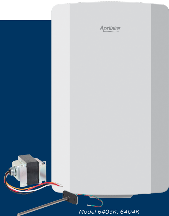
Model 6403K, 6404K