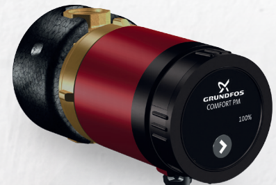
UP 10-16 Basic