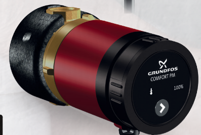
UP 10-16 HWR Temperature