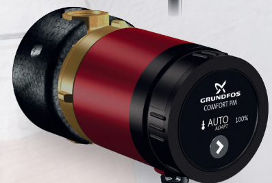
UP 10-16 AUTOADAPT

For more information on Grundfos hot water recirculation products, please visit: grundfos.us/up10