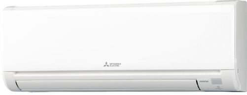
Indoor Unit: MSZ-GL15NA-U1