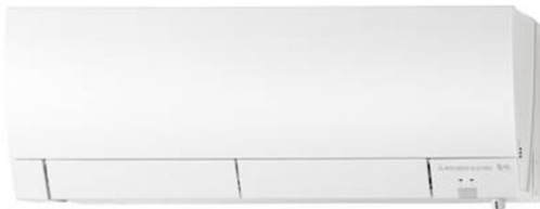
Indoor Unit: MSZ-FH15NA