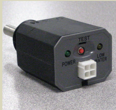
Optional LWCO Kit available